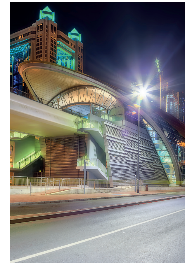
Dubai Burj Khalifa metro station – protected by SteelMaster

The Jotun Group is one of the world's leading manufacturers of paints, coatings and powder coatings. Jotun's operations ensure the very best in paint systems and products to protect and decorate surfaces in the residential, shipping and industrial markets. Everything we do, from development to production, marketing, sales and consultancy for various paint systems and products to protect the property of our customers the world over.